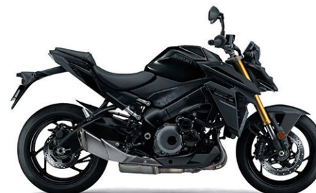
Glass Sparkle Black (YVB)