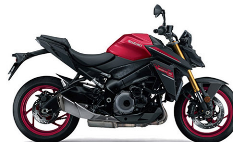
Candy Daring Red (YYG)