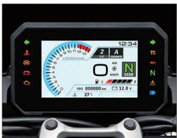
Color TFT Multi-function Display