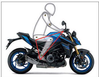
Comfortable Upright Riding Position