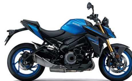
Metallic Triton Blue (YSF)